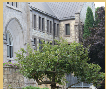
New Melloray Abbey is beautiful.